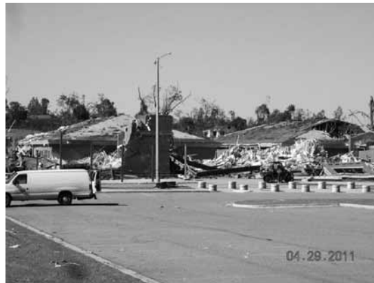
APRIL 27, 2011 TORNADO ALBERTA ELEMENTARY, TUSCALOOSA, ALABAMA

The State Insurance Fund experienced its worse loss year in its history in FY 2011 when a catastrophic tornado outbreak occurred on April 27, 2011. Producing more than 550 claims from 215 locations, reserves quadrupled those of Hurricane Ivan in 2004. Tornadoes caused massive destruction to six K-12 schools, one community college and a state park and badly damaged additional structures at other multiple locations. The State Insurance Fund has excess insurance coverage which responds to occurrence claims exceeding $3,500,000.00.